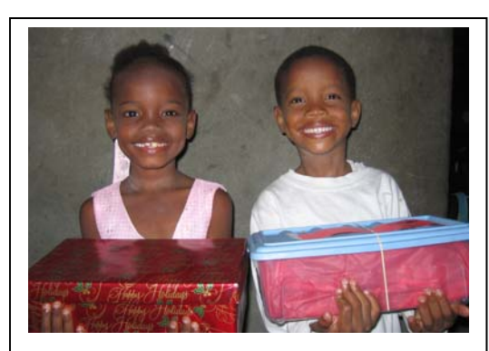
Area children receiving donated Christmas gifts from Minnesota & Florida!