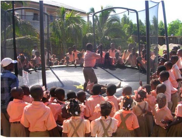
Imagine the first time you ever saw a trampoline? One donor's special gift is a big hit at the school!