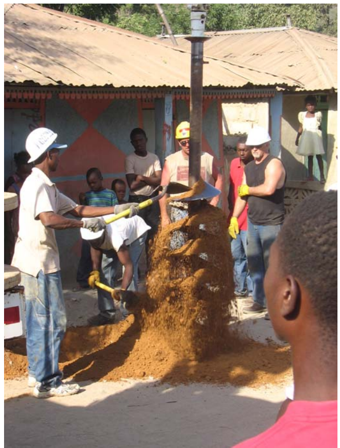
Minnesota linesmen volunteer in February 2006 to place poles for electrical service in Pignon, Haiti. Notice the crowds watching and Haitian workers alongside! We hope to hook up 300 more homes in January 2007!