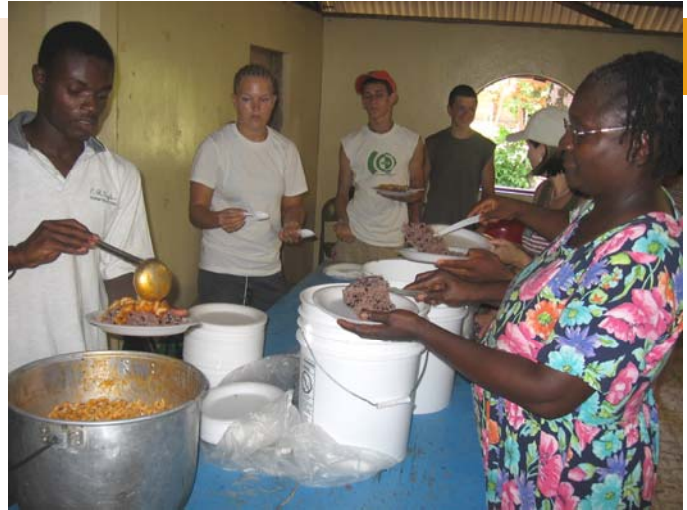
Florida volunteers help serve lunch at a summer Bible school, beans and rice! Ummmm!